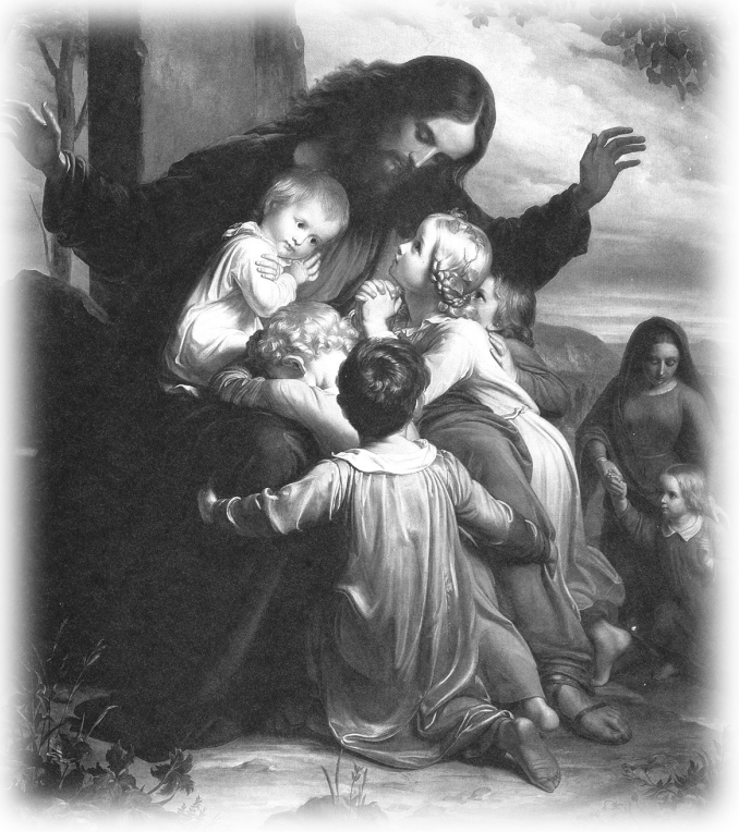
Jesus Christ "...by the grace of God should taste death for every man..." woman and child. Heb. 2:9

The due time for the "little flock" to hear and believe on the name of Jesus is between the first and second advents of Christ. The due time for "the remainder of men" to hear and believe is in the thousand year Kingdom of Christ. The "little flock" or "Church of Christ" will "reign along with him during the thousand years [to bless and judge the world in righteousness]." Rev. 20:6 Moffatt translation; 1 Cor. 6:2; Psa. 96:13