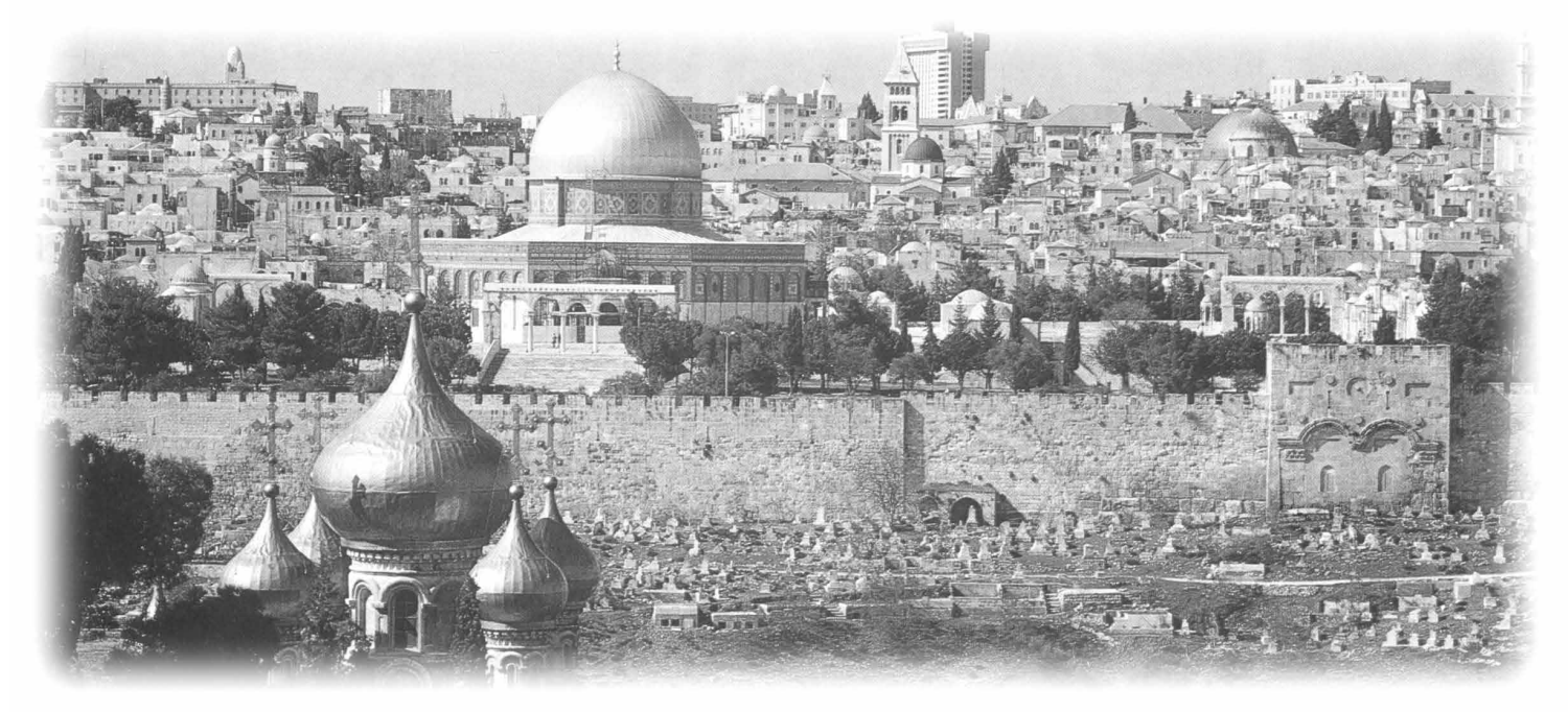
"Pray for the peace of Jerusalem: they shall prosper that love thee." — Psalm 122:6

In the continuing battle for Jerusalem, Israel occupies a precarious position. Her enemies are numerous and her friends are deserting her. This struggle for Jerusalem is not primarily political but religious, as Arabs, Jews—even some Christians—claim a God-given right to Jerusalem as their capital.