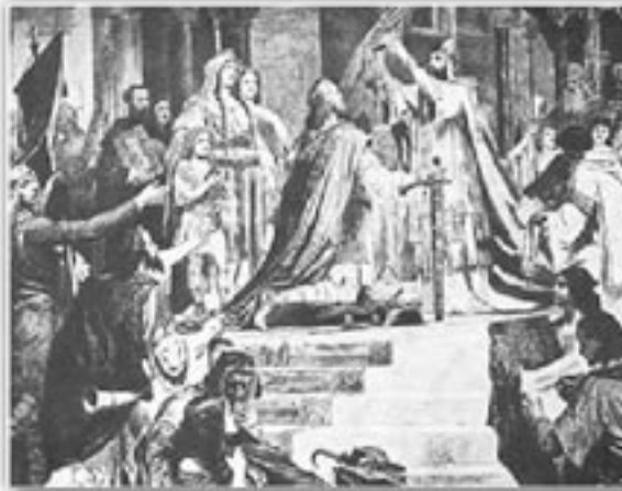
Pope Stephen II Crowning King Pepin A.D. 754

Serious injury has come to the children of God as a result of the church nominal (in name only) and her illicit affair with the world. The followers of Christ have been led to an improper recognition of and intimacy with earthly kingdoms, to the neglect of the gospel concerning the true Kingdom and the hopes centered in it. Truly, the best and the worst of earth's nations are but " kingdoms of this world " whose lease of power from God has expired so that they may give place to their ordained successor, the Kingdom of Messiah—the fifth universal empire of earth. Isaiah 32:1; Daniel 2:44; 7:14, 17, 27; See also End Times , Winter 2002 Issue