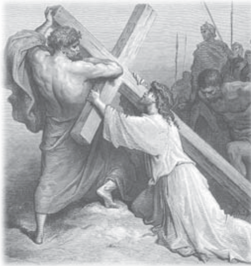
"Christ also hath once suffered for sins, the just for the unjust, that he might bring us to God..." 1 Pet. 3:18

out, when the times of refreshing shall come from the presence of the Lord... Whom the heaven must receive until the times of restitution of all things, which God hath spoken by the mouth of all his holy prophets since the world began.... him shall ye hear in all things whatsoever he shall say unto you. And it shall come to pass, that every soul which will not hear that prophet, shall be destroyed from among the people." Acts 3:19-23